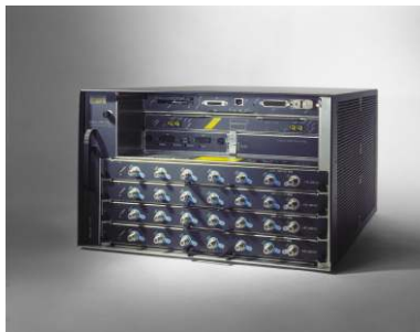
Cisco uBR7246VXR Universal Broadband Router