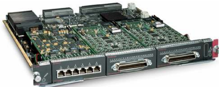
Figure 1. Cisco Communication Media Module

The Cisco CMM is a modular line card that supports four different types of port adapters, including 6-port T1, 6-port E1, 24-port foreign exchange station (FXS), and 128-port conferencing and transcoding port adapters. Up to four port adapters can be installed in a single Cisco CMM Line Card. Customers have the flexibility of mixing any of the four types of port adapters in a single Cisco CMM (Note: Mixed E1 and T1 port adapters on the same CMM are not allowed).