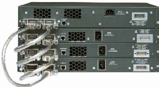
Figure 5. Cisco Catalyst 3750 Series Switches

The Cisco Catalyst 3750 Series (Figure 5) offers both a superior command-line interface (CLI) for detailed configuration and Cisco Network Assistant Software, a Web-based tool for quick configuration based on preset templates. In addition, CiscoWorks supports the Cisco Catalyst 3750 Series for networkwide management. Table 1 lists the features and benefits of the Cisco Catalyst 3750 Series.