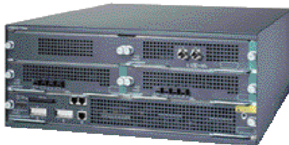
Figure 1. Cisco 7304 Chassis

The Cisco 7304 provides numerous connectivity options, from DS0 to Gigabit Ethernet and OC-48/STM-16, in an architecture engineered for high availability and multiprotocol support. With built-in Gigabit Ethernet ports and support for Cisco 7200 Series port adapters, the Cisco 7304 is a leading-edge, flexible, feature-rich router for the network edge.